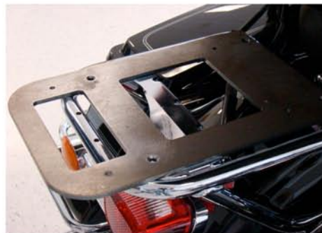
pic # 4

Questions ??? call us on 1-877-672 0288 or email des@ultimateseats.ca Web site – www.ultimateseats.ca