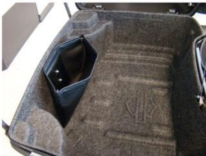
pic # 1