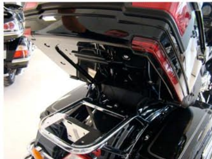
pic # 3